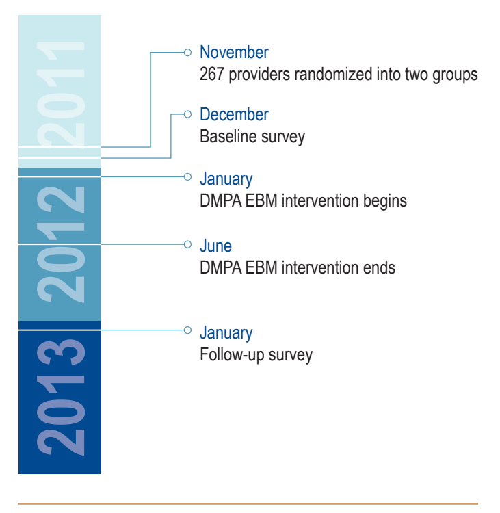
Figure 1. Study Timeline

The evaluation sample consisted of 267 private family planning providers in two urban areas: Amman and Zarga. SHOPS randomly assigned 135 providers to a treatment group and 132 providers to a control group. Over the course of six months, only the treatment group providers were invited to attend the roundtable discussion on DMPA and received two detailing visits at their clinics. SHOPS conducted a baseline and a followup survey with both groups before and after the EBM DMPA program (see Figure 1). The surveys collected information about the providers' knowledge of DMPA side effects, their attitudes toward and confidence in the method, and their reported clinical practices such as discussing DMPA with clients or prescribing it. The SHOPS team constructed four scores to assess main outcome measures in knowledge, attitude, confidence, and practice.